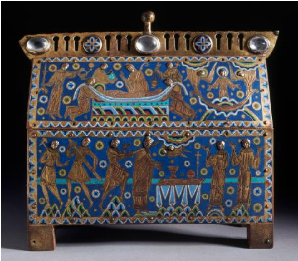
The Becket Chasse Image