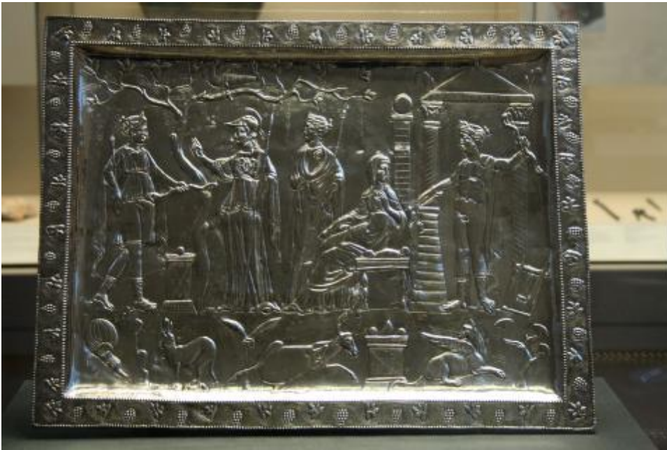
The Corbridge lanx Image