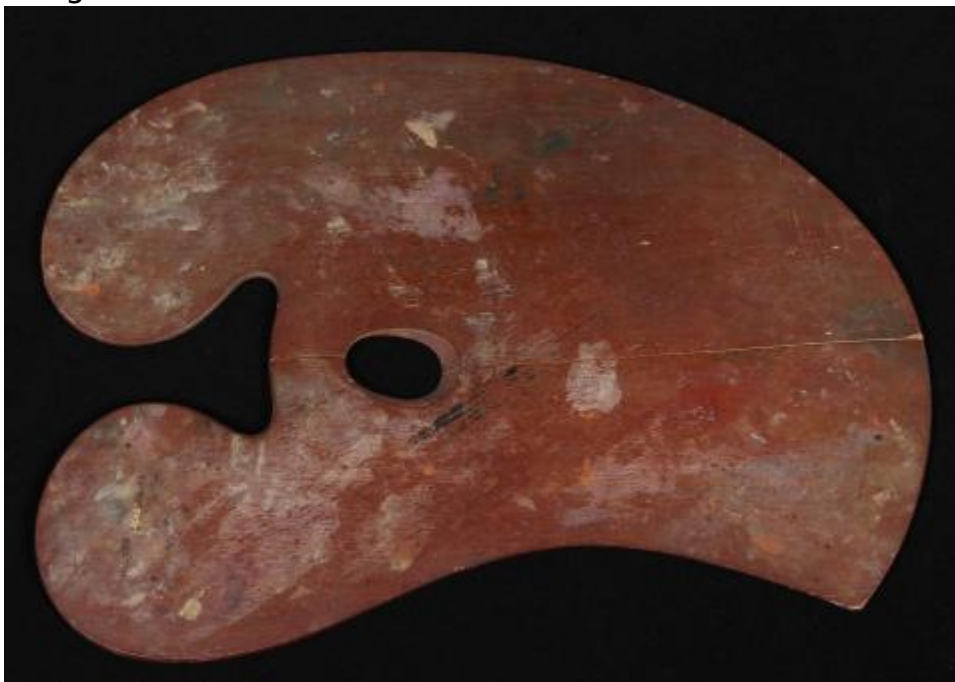
Artist's palette used by Lawrence at Santa Fé, New Mexico (c.1922-1925)