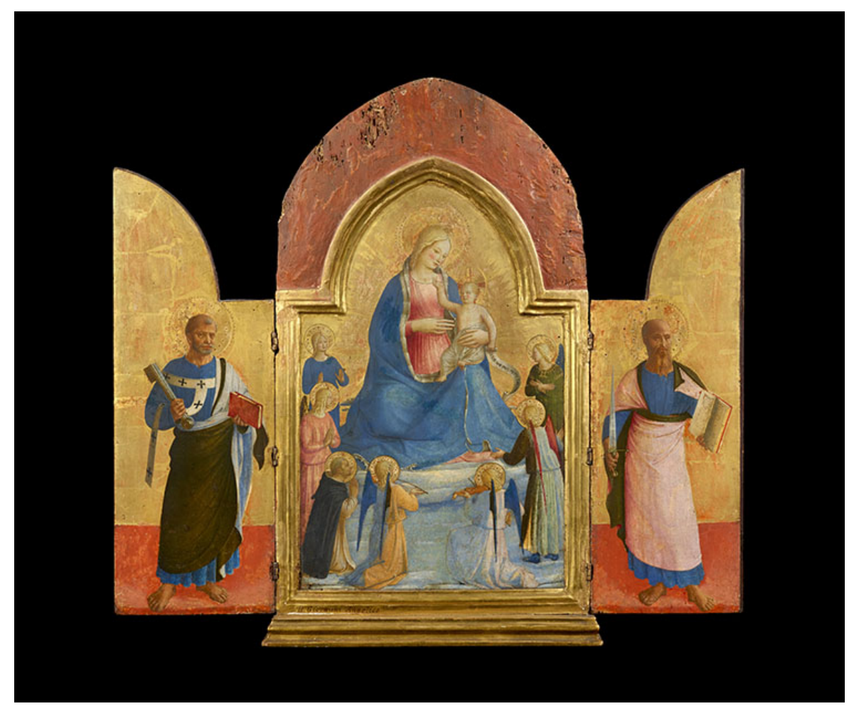
The triptych, which depicts the Virgin and Child with angels and a Dominican saint flanked by St Peter and St Paul, is one of only a few examples of Fra Angelico's work in a British public collection.